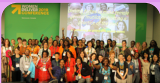
Women Deliver Conference 2023